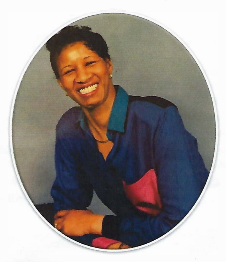
Saturday, August 13, 2022