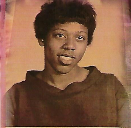
SCHOOL DAYS 1957-58 GORDO H. S.